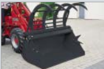
silage bucket with grab