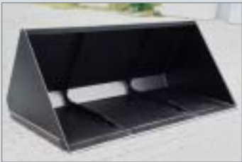
light material bucket