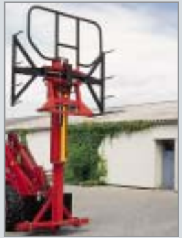
fork lift for big bales