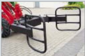
big bale gripper