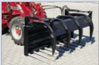
heavy duty manure fork with grab