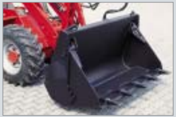
4:1 opening bucket