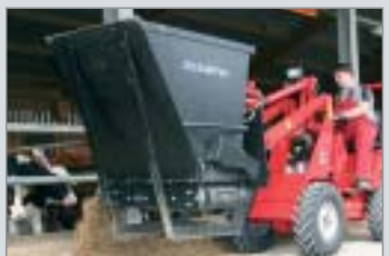
feed bucket with rubber conveyor