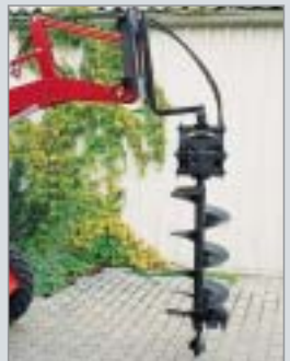
post hole driller