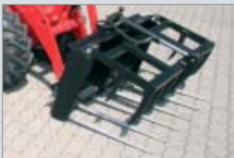
manure fork with grab