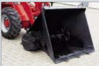
feed bucket with screw conveyor