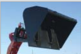
high tip bucket