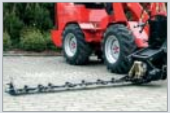
double knife mower