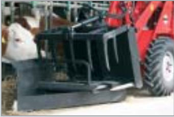
feed blade with manure fork with grab