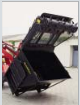
feed bucket with turbo milling head