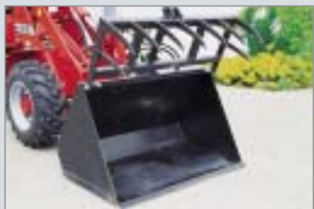
standard bucket with grab