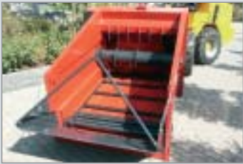
straw blower for big bales