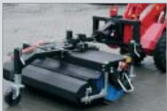
sweeper with dust bucket