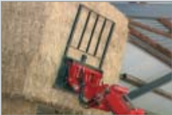
pallet fork for big bales with supporting frame