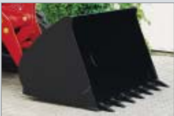
heavy duty bucket with teeth